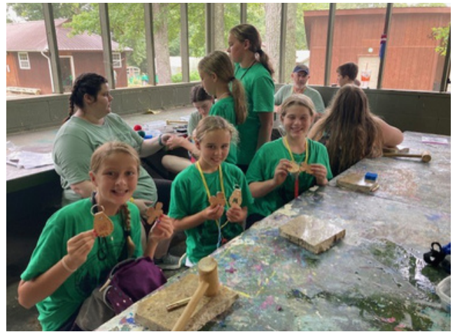
Tye-dye & Leatherwork class

Unfortunately, the May 26th storms caused damage to 4-H Camp and we were unable to attend on our original dates in May. Thankfully, we were able to hold a Camp-palooza event that week instead, and reschedule for a weekend in July and still attend camp. Our counselors and camper families handled the challenge with grace and we eventually had a super fun weekend at camp! Youth took fun classes in the mornings, had free swim/recreation in the afternoons, and ended each night with dancing and sally!