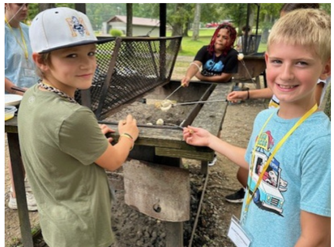
Outdoor Cooking class