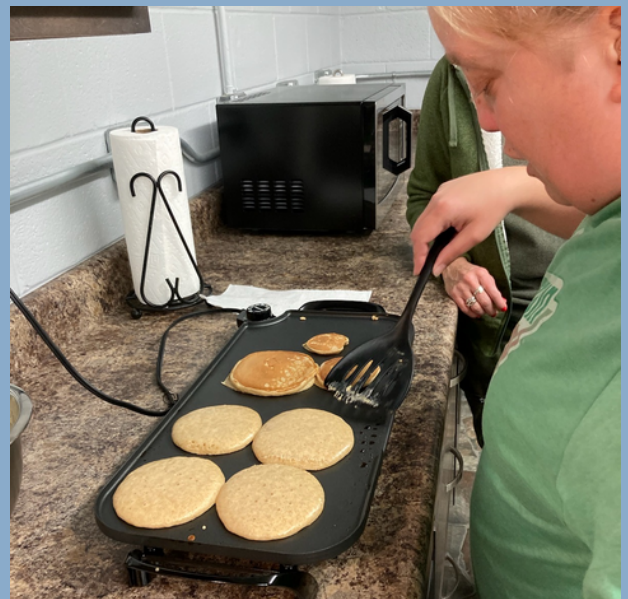
NEP Healthy Choices for Every Body Breakfast Fall 2022