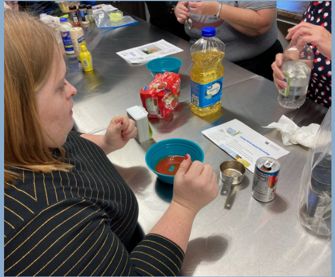
NEP Healthy Choices for Every Body Salad Dressing Fall 2022